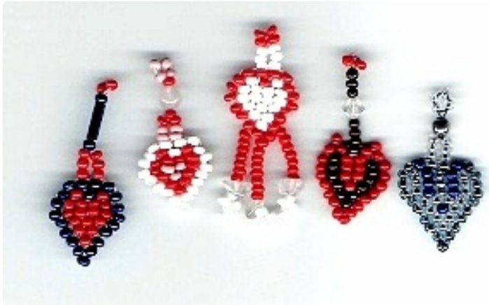
Figure 1 – Finished hearts